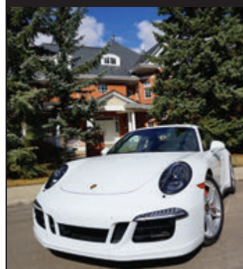
Konan and alana Kublik's 2016 Carrera 4 GTS